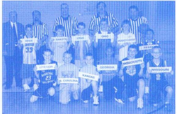
8-9 BOY CHAMPIONS