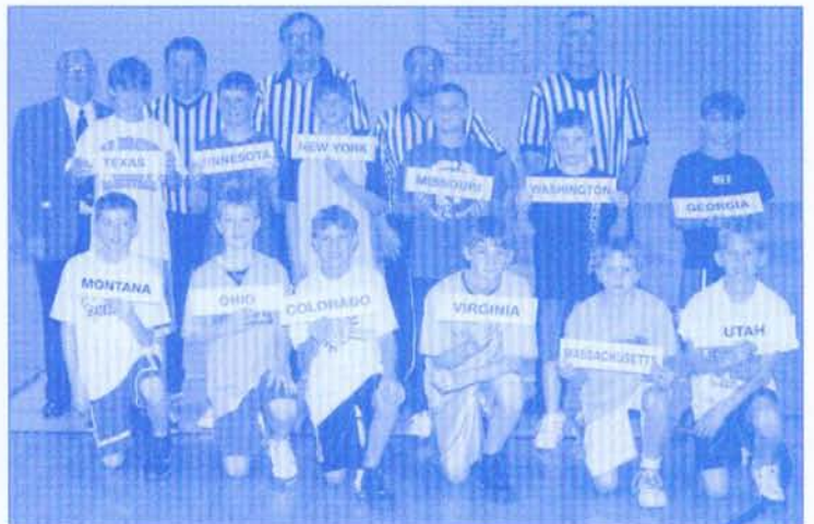
10-11 BOY CHAMPIONS