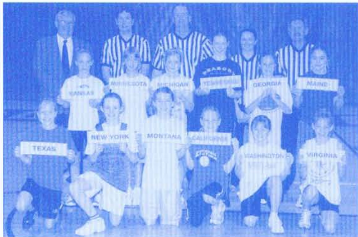
10-11 GIRL CHAMPIONS