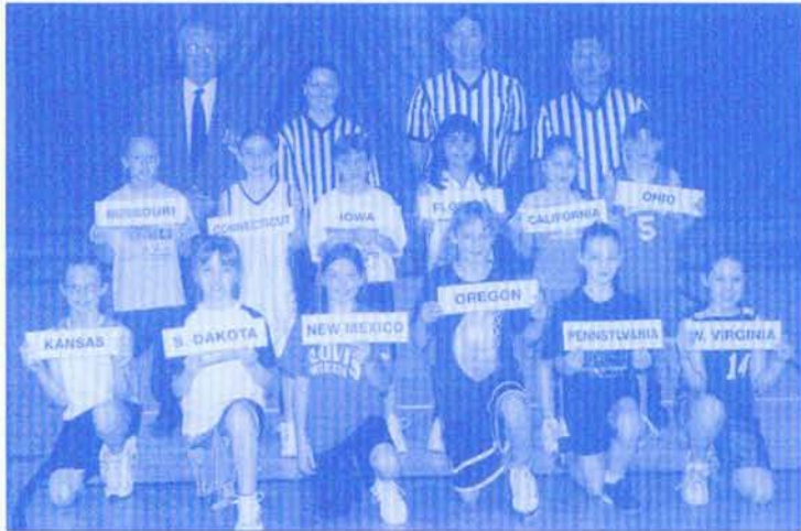
8-9 GIRL CHAMPIONS