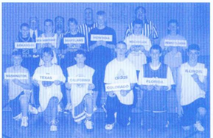
12-13 BOY CHAMPIONS

BACK PANEL OF BROCHURE SHOWS WHERE EACH CONTESTANT IS FROM