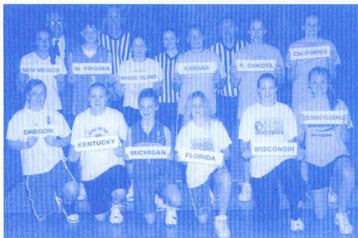
12-13 GIRL CHAMPIONS